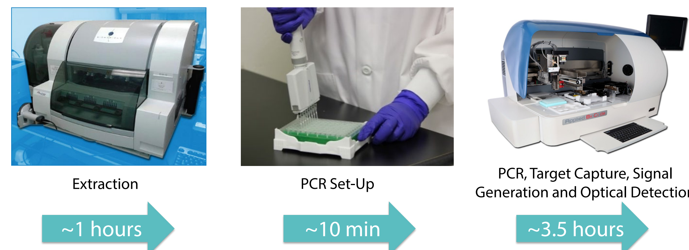
Figure 2. Workflow for BioCode® RPP. 192 samples in an 8 hour shift with minimal hands on time for MDx-3000. Three different BioCode panels can be performed simultaneously in one plate.